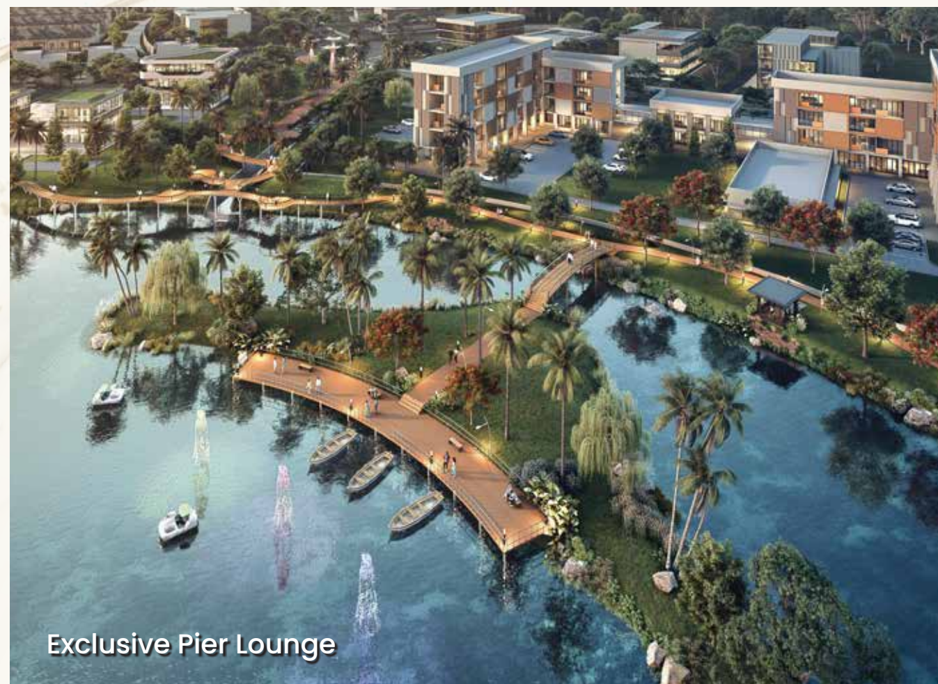
Exclusive Pier Lounge