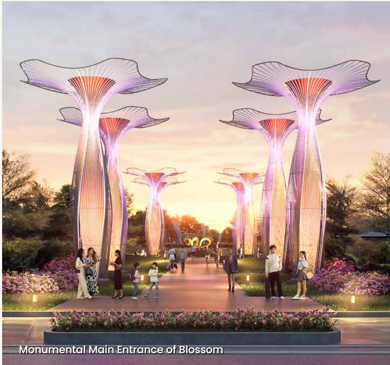
Monumental Main Entrance of Blossom

Step into a world where elegance meets nature. Grand Lagoon welcomes you with the signature main entrance that sets the tone for an extraordinary experience. Stroll along the elevated skywalk as the lake shimmers beneath your feet, pause at the waterside amphitheater where golden sunsets frame unforgettable moments, and find serenity beneath the sculpted pergolas that blend artistry with comfort. With every detail crafted to delight the senses. Including a vibrant outdoor playground for joyful family moments. Grand Lagoon is a celebration of life's most graceful pleasures.