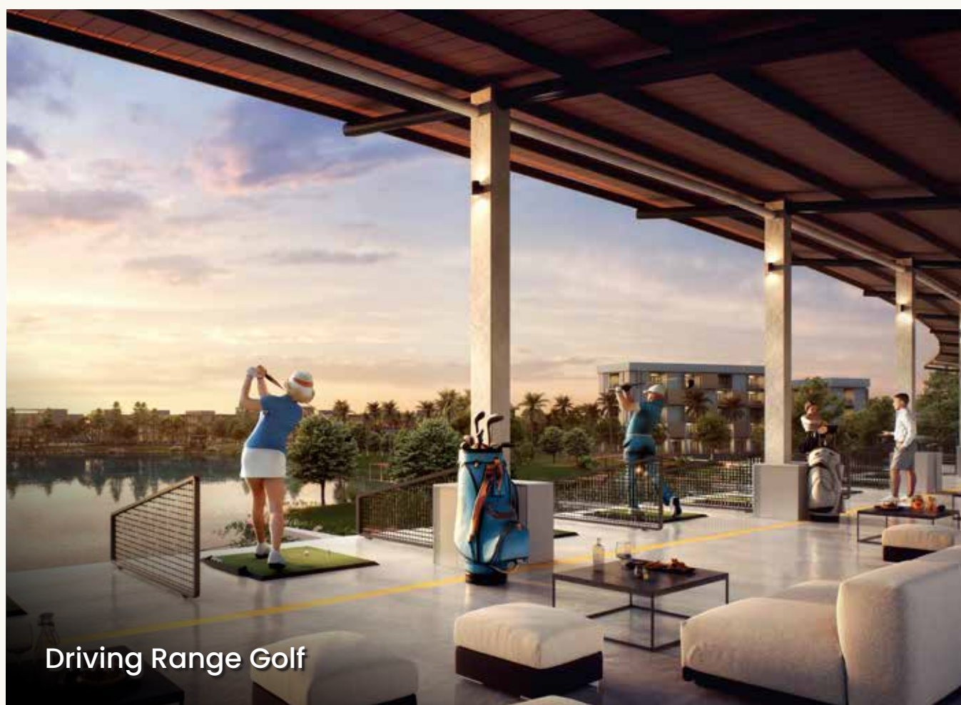
Driving Range Golf